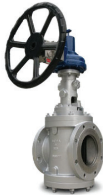
Rising Stem DBB Plug Valves