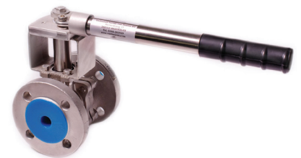
Dead Man Handle Ball Valves