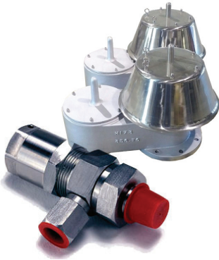
Pressure & Thermal Relief Valves