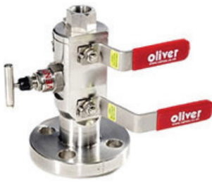
Double Block & Bleed (DBB) Valves