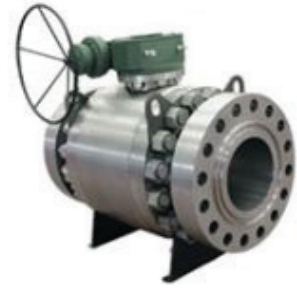
Ball Valves (Manual & Actuated)